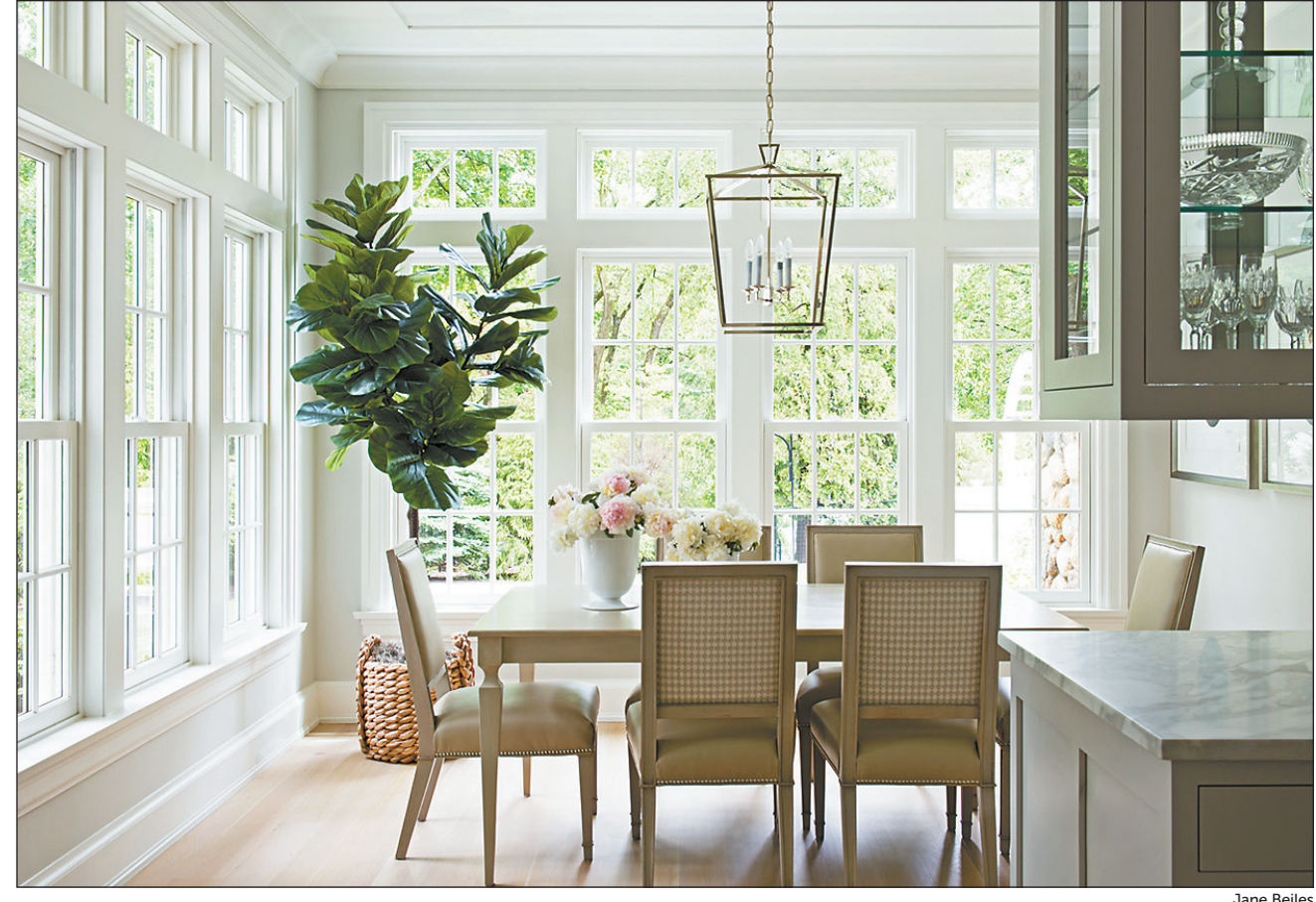
A breath of fresh air.

On the Cover This "Georgian surprise" kitchen is one of seven that will be featured as part of the 26th annual New Canaan CARES Kitchen & Home Tour, scheduled for Thursday, May 17.