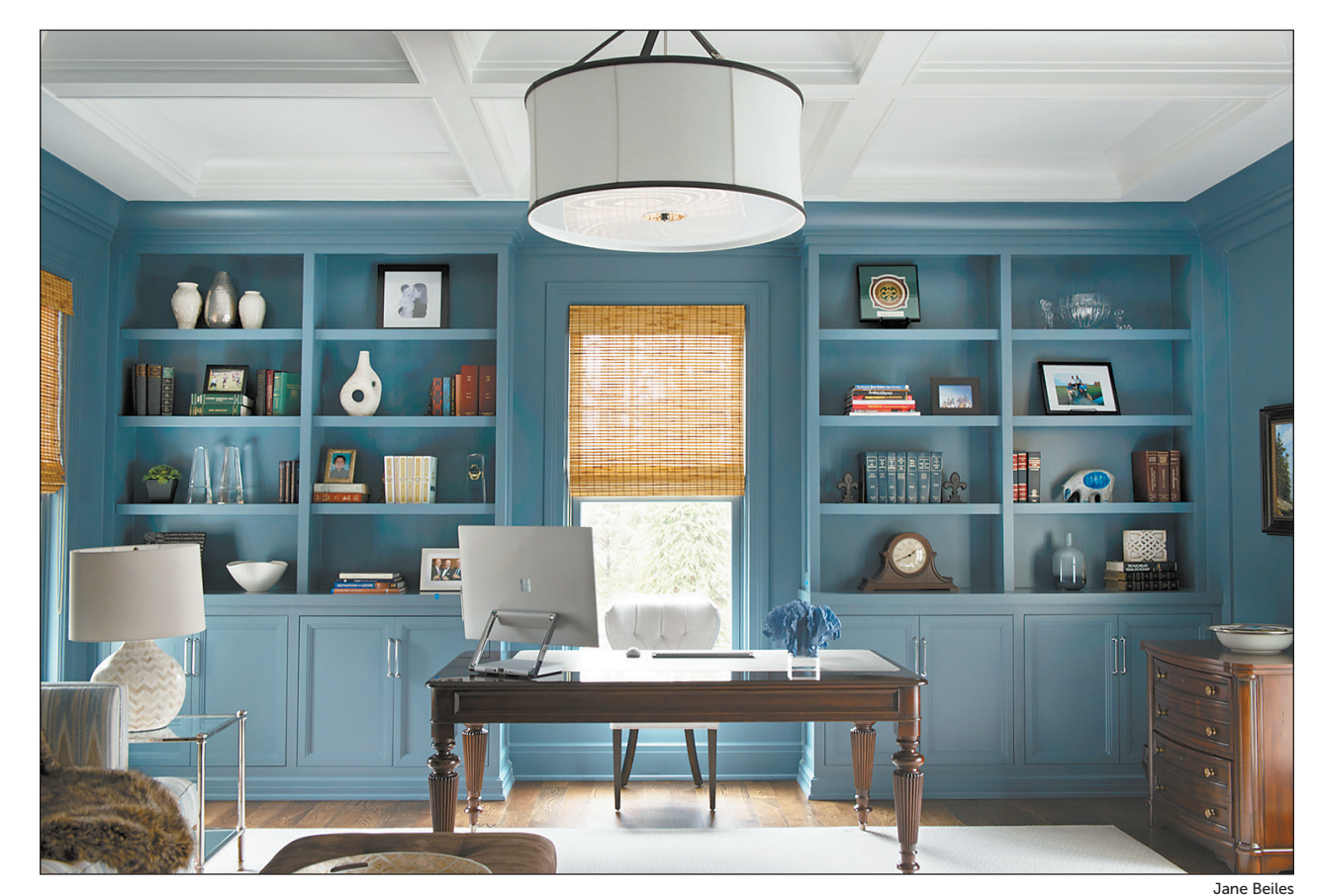
The future of new construction.