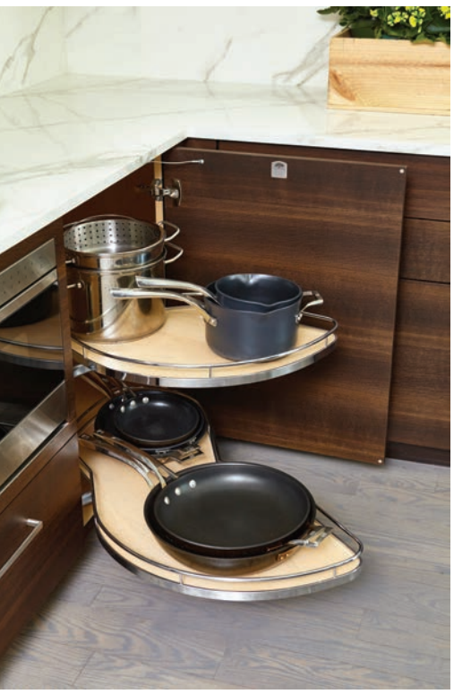
JAN/FEB 2019 athome