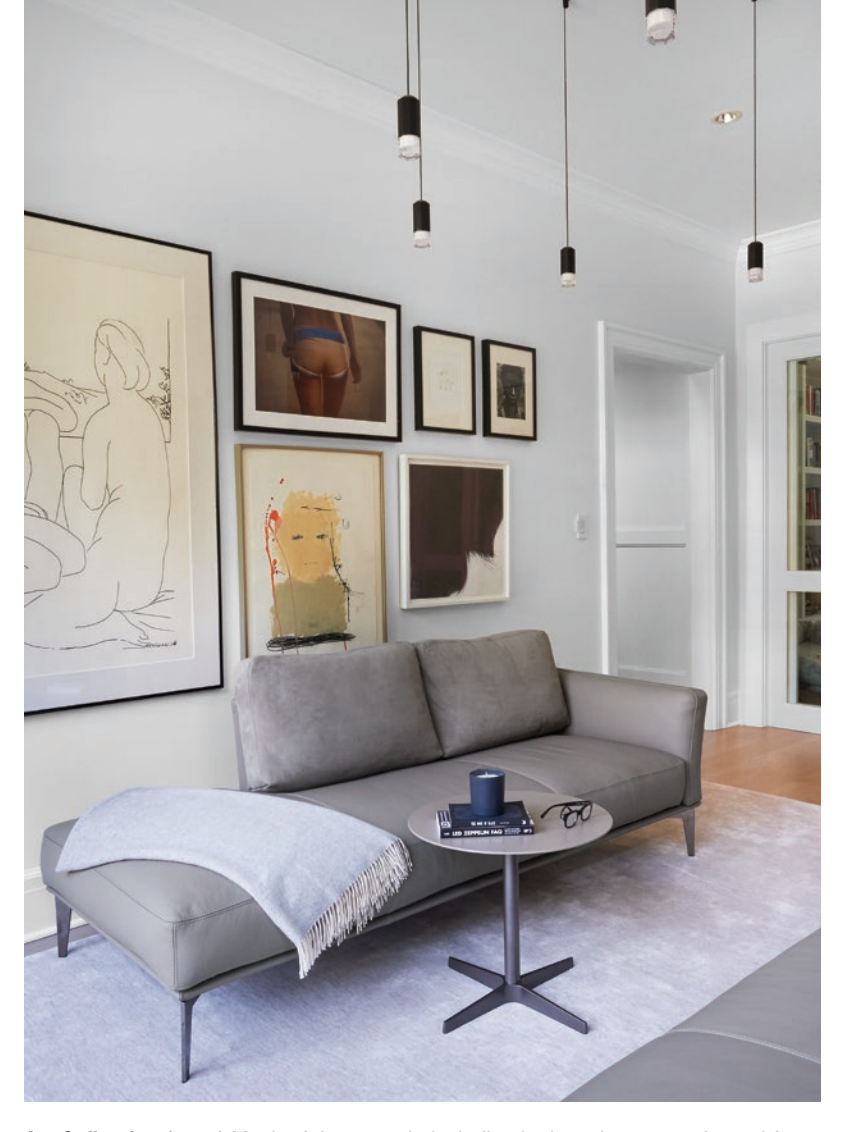
Art Collection (ABOVE) Much of the artwork, including in the salon, was reframed for a more modern look. Lighting is Wireflow by Vibia. Formal Entry (BELOW) The bench in the foyer is from Blackcreek Mercantile & Trading Co.; the pendant lighting is from Circa Lighting; and the rug is from Woven Concepts. See Resources.